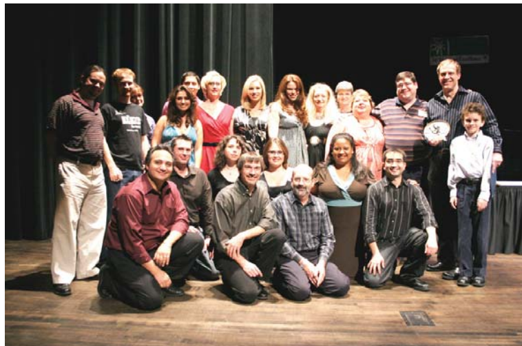
Participants in Festival 08