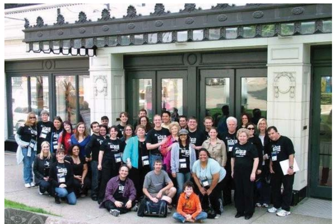
Cast and crew of Nine in Tacoma, Washington

SAVE THE DATE! Dubbed the "Festival in Paradise", Venice Theatre has been selected to host the 2010 International Amateur Theatre Festival . Companies from around the globe will converge June 22 -27 on the Gold Coast of Florida. Workshops, networking opportunities, and multiple performances will be offered. Information and reservations can be made at www.venicestage.com/international or by