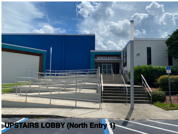
UPSTAIRS LOBBY (North Entry 1)