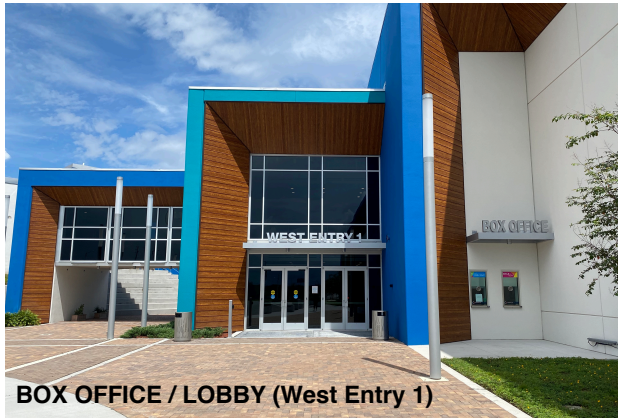
BOX OFFICE / LOBBY (West Entry 1)

Theatre Winter Haven Chain O' Lakes Civic Center 210 Cypress Gardens Blvd. Winter Haven, FL 33880 theatrewinterhaven.com