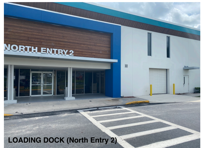
LOADING DOCK (North Entry 2)

Theatre Winter Haven Chain O' Lakes Civic Center 210 Cypress Gardens Blvd. Winter Haven, FL 33880